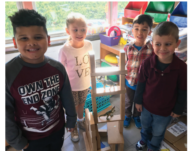
Animals and blocks: What can I make?

Play is the foundation we lay with our youngest students toward meeting this mission.