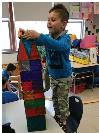
What can you build only using squares?

Purposeful Play is not recess. Kindergarteners have time for Purposeful Play and recess every day.