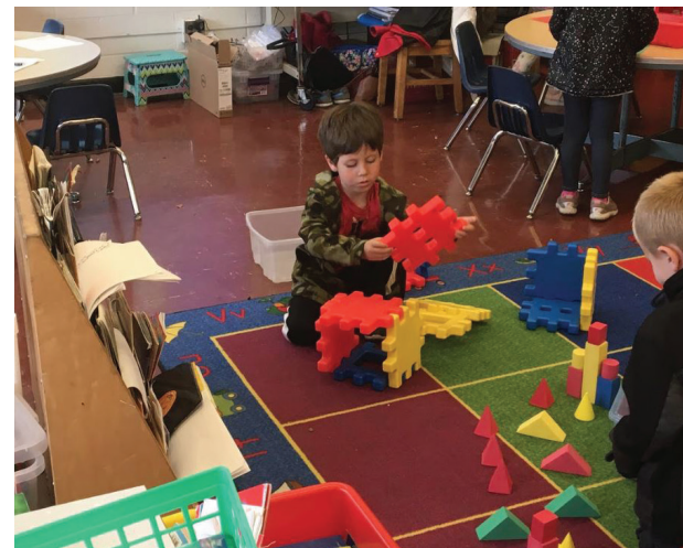
Building and exploring with blocks.