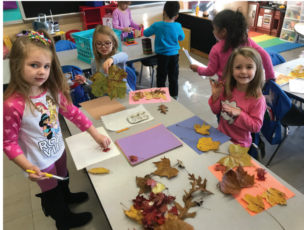
Creating with nature.

“Play is often talked about as if it were a relief from serious learning. But for children, play is serious learning. Play is really the work of childhood.” - Fred Rogers