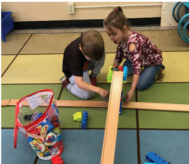
Using ramps and tunnels.